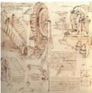
Water Lifting Device